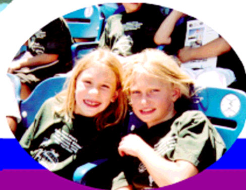
CONNECT WITH FRIENDS