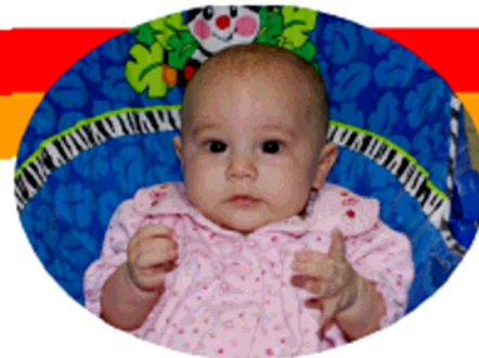
GROW WITH US