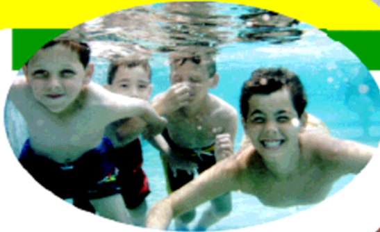
SUMMER CAMP PROGRAM